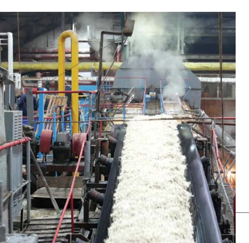
ABB will ensure you are aware of any upgrades or retrofit opportunities. If you've registered your drives and motors with us, then our engineers will proactively contact you advising on your most effective replacement option. All of which helps maximize performance, uptime and efficiency throughout the lifetime of your powertrain.

When you've decided on the right product, ABB and its global network of ABB Value Providers can help with installation and commissioning. They are also on hand to support you throughout the operations and maintenance phases of the products life cycle, providing preventive maintenance programs tailored to your operational needs.