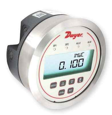
Note: Shown with optional -SS bezel. Backward compatible with Magnehelic® Gage.