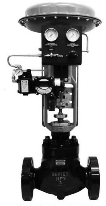
Mark HPX Series Valve